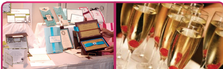
Viewing the displays is exciting...

See charming and breathtaking exhibits presented by the finest wedding suppliers this side of the globe. A free Wedding Guide copy is your keepsake!